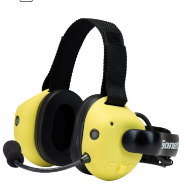
+ TWO-WAY RADIO