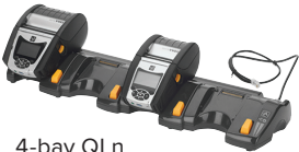
4-bay QLn Ethernet Cradle

Connect QLn printers to your wired Ethernet network via the QLn Ethernet cradle to enable easy remote management by your IT or operations staff — helping to ensure each printer is operating optimally and ready for use. The Ethernet cradle can communicate over 10 mbps or 100 mbps networks using auto-sense.