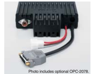
Photo includes optional OPC-2078.

The optional ACC cable allows you to connect with various external devices to control audio output, modulated signal input, remote channel control, horn honk and many more functions. OPC-1939 is a D-SUB 15-pin type and OPC-2078 is a D-SUB 25-pin type.